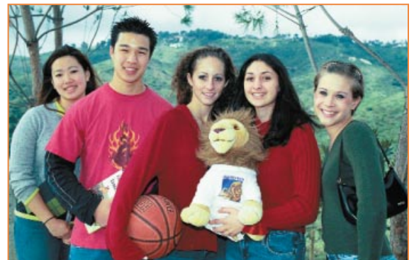
Prospective students gather at SUA in early March.

the United States and come from 17 different states. The remaining students are international, representing 15 different countries and territories: Argentina, Austria, Fiji, Ghana, India, Japan, Korea, Peru, Philippines, Puerto Rico, Singapore, Thailand, Turkey, Venezuela, and Zambia. The demographic statistics of these accepted students reflect those of the applicant pool. WT