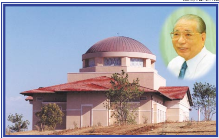
Soka University of America, Aliso Viejo, founded by SGI President Ikeda, will be dedicated on May 3.