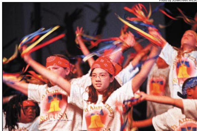
In the second Seven Bells, today’s youth will ‘secure the foundation for peace throughout the world,’ SGI President Ikeda says. Above, Philadelphia Region youth perform in October 2000.

Goal: To see the philosophy of the sanctity of life established as the spirit of the age and the world.