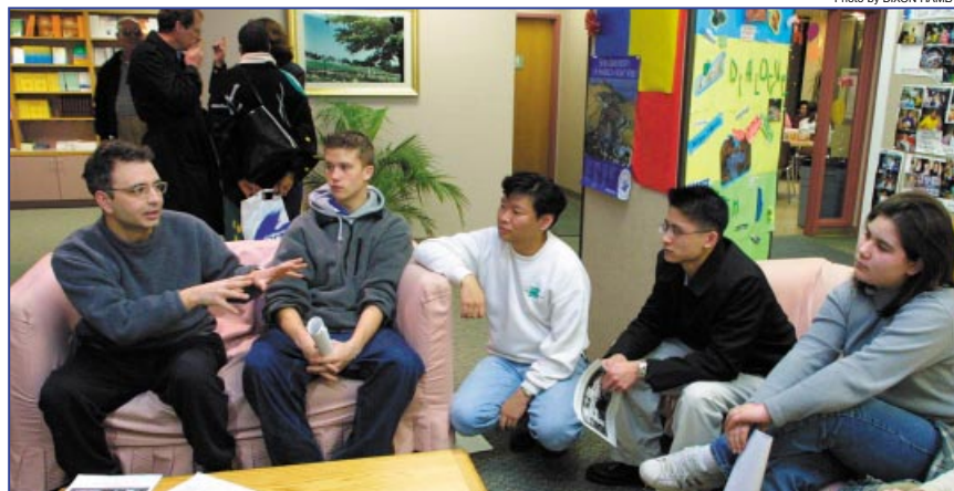
Pacific Northwest youth discuss the meaning of Kosen-rufu Day at the Seattle Culture Center, March 16.