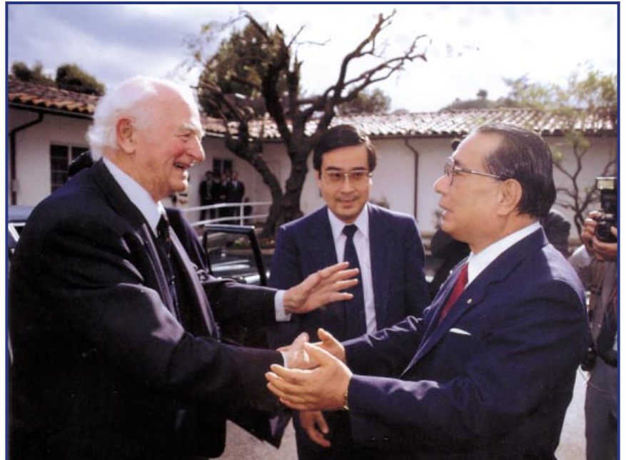
Linus Pauling meets with SGI President Ikeda at SUA, Calabasas in 1987. President Ikeda, founder of SUA, proposed the idea for the 'Linus Pauling and the Twentieth Century' exhibition.

In the early 1960s, Pauling, did not hesitate to take on the