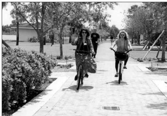
Participants enjoy a bicycle ride amidst the scenic beauty of the FNCC.

1998-February 1999) our Boston Culture Center. At first I thought what a great opportunity to do a little artwork. Little did I know! I worked every weekend, sometimes scraping, sometimes painting and mostly dealing with dust, dirt and grime. It was the most valuable experience in my SGI years. Only toward the end did I end up uniting with other artists and creating actual wall designs and beautifying the lobby. We chanted many hours together trying to unite. Because of this effort, I have been able to bring