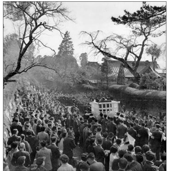
Due to his failing health, the youth made a litter to carry President Toda at the ceremony on March 16, 1958, in which he entrusted them with the mission to accomplish kosen-rufu.

In doing so, the first, most important thing is to live out your lives together with the SGI, the organization acting in accord with the Buddha's decree. If you stay true to your mission and boldly walk the great path of faith your whole life long, you will have no regrets. As the great Chinese historian Ssu-ma Ch'ien says, "Though I should