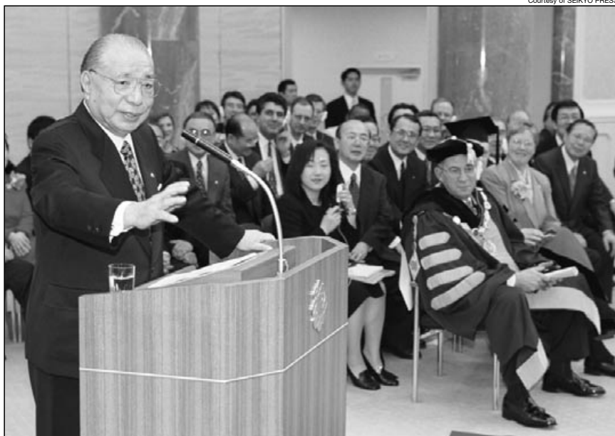
SGI President Ikeda gives his acceptance speech on the conferral of an Honorary Doctorate of Humane Letters from the University of Delaware, Newark, Del., at the Tokyo Makiguchi Memorial Hall, Hachioji, Tokyo, on Jan. 15.

The University of Delaware traces its origins back to a school founded in 1743 through the commitment and dedication of one young man. That young man was a Scotch-Irish clergyman by the name of Francis Alison, who emigrated to America from Ireland. During America's colonial period, there was not a single college nor even a good grammar school in