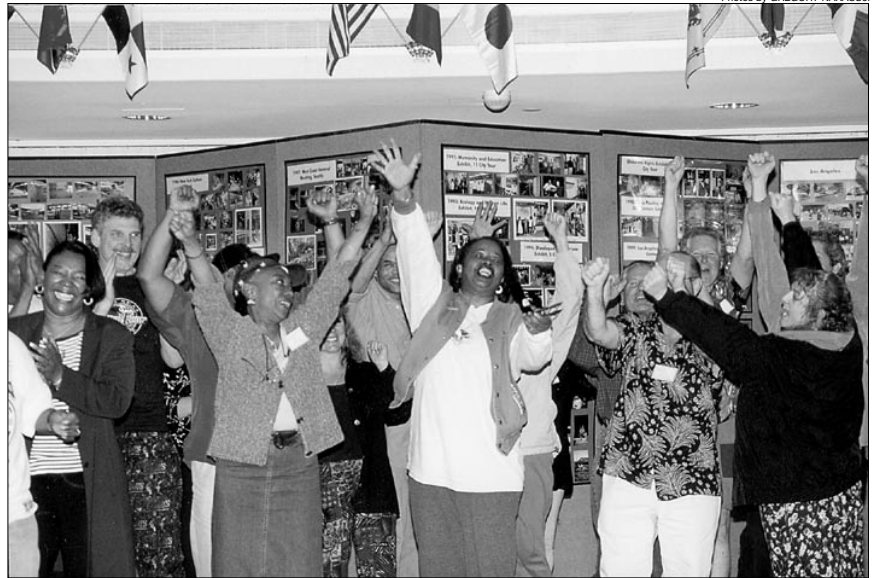
Participants celebrate together during the Friendship Exchange.

many of my friends to the culture center, one of whom received the Gohonzon last fall. I also married the man who designed an incredible walkway and who has encouraged me to pursue a life of my dreams. Our efforts to build our castle together has created an indestructible bond. Together we faced enormous obstacles—and won! I hope to continue in this way, forever building and helping to construct a new SGI-USA.