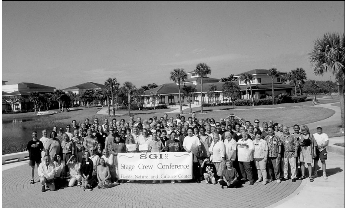
Participants in the first Stage Crew Conference held March 16-19 at the Florida Nature and Culture Center, came together to celebrate 30 years of effort to support SGI-USA activities. The conference focused on renewing old friendships, making a fresh start toward the next 30 years and discussing ways to attract and raise young people in the stage crew.

the great struggles to bring each aspect of these productions together united me with stage crew members throughout the SGI. I have many fond memories that will live on forever. The negative side of my life surfaced, and I spent eight years spiraling deep into the world of drug addiction. Finally in 1989, I started my ascent. Using passages from the Goshu, daimoku and the will to claim my role in the battle for world peace, I have turned poison into medicine. Today my life is the result of "one who has fallen to the ground and pushed himself up