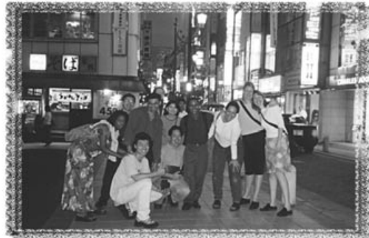
Youth participants taking time off for some sightseeing.

I still am grappling with what it means to fuse one's life with one's mentor. However, I am confident in that my life and the lives of those who fight alongside President Ikeda will experience boundless fortune beyond what one may accumulate if one only seeks good circumstances. I am determined to develop and help others develop this heart of a lion so that President Ikeda can count on us to lead the way to worldwide kosen-ruffi. ♪