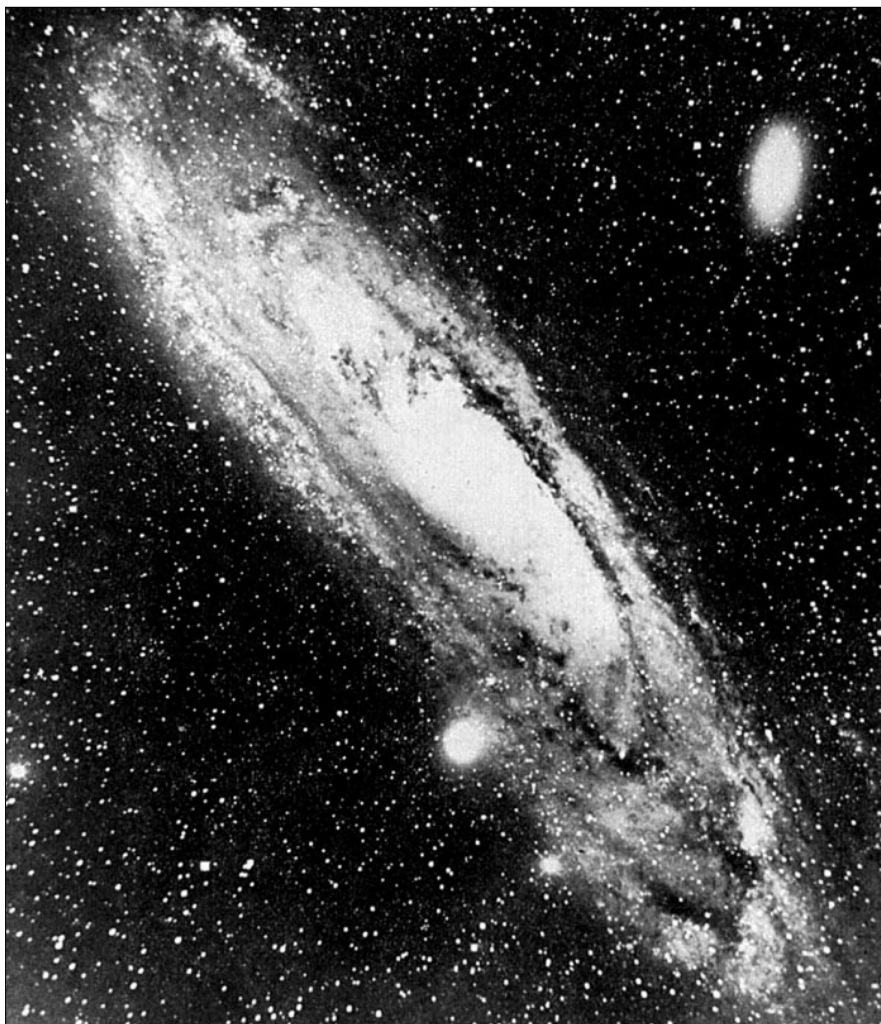
'The universe is a giant living entity. Buddhism teaches that life is the universe and that the universe is life. Each of us is a living entity just like the universe; we are our own little universe.'

Science, for its part, is devoted to the investigation of real, yet invisible, natural laws. Such investigation has led to the invention of many machines and devices that apply those laws.