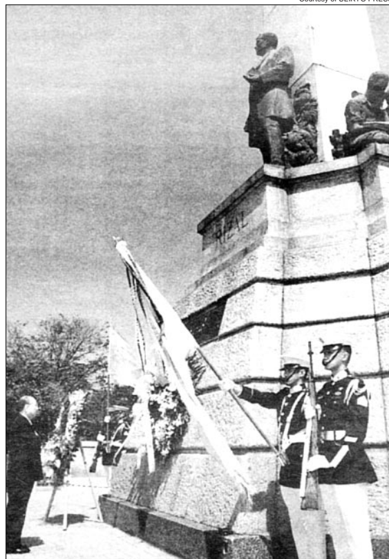
SGI President Ikeda visits the monument dedicated to José Rizal.