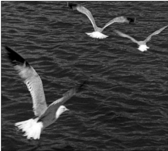
It is difficult to grasp fully the profound meaning of the Mystic Law through purely theoretical means. Looking at the animal kingdom, each species has its own unique means of communication or language. We humans cannot understand it, but birds, for example, clearly understand the language of other birds.

science, Buddhism is devoted to the investigation and exploration of the Mystic Law — the great law of life itself that is the essence and source of all other laws and principles in the material and spiritual realms.