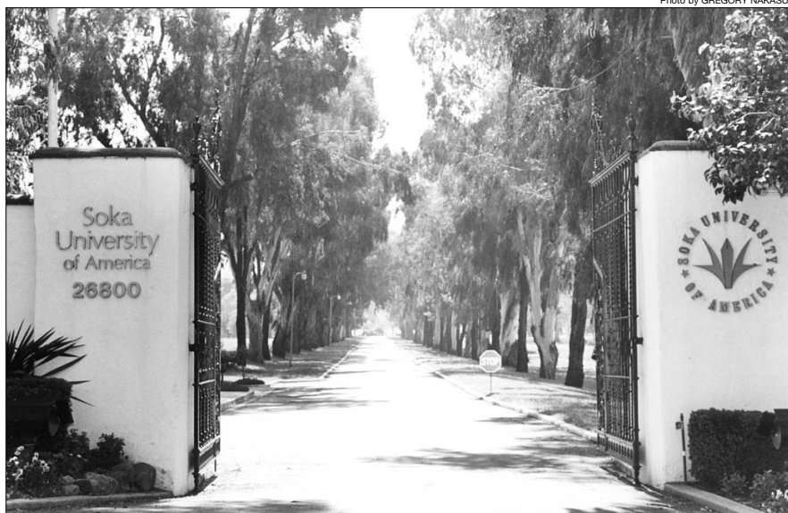
The entrance gate to Soka University of America's Calabasas campus.

If you have a short report of a special event in your area that you'd like to see in "News Briefs," please contact your local bureau chief, call us at (310) 451-8811 or e-mail us at SokaNews@aol.com .